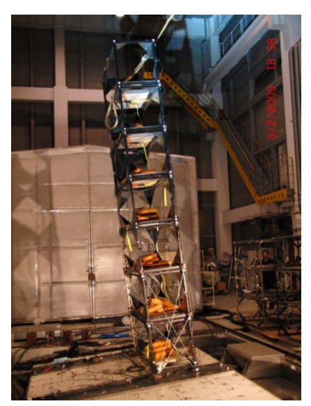
Figure 1: Stack testing at NYK-MTI