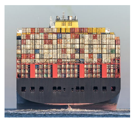
Present-day ULCC